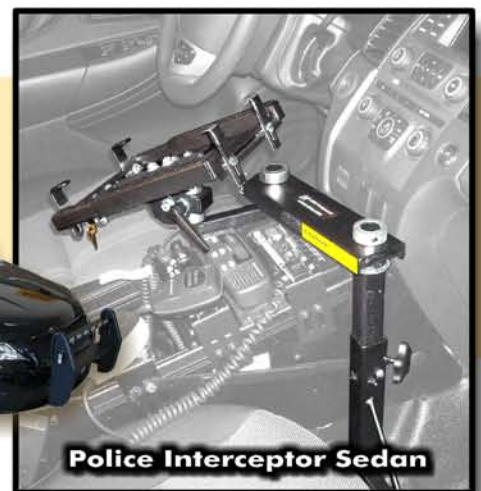
TA-2505 shown with Laptop Tray (Not Included)